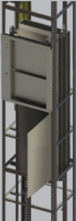
DD600 & DD800